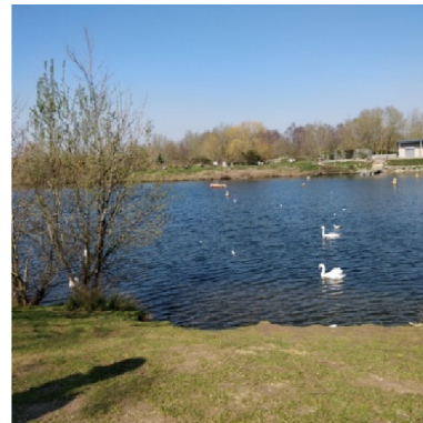
Lunch stop beside Ocean Lake

We could do with some new members. At the moment we meet on the third Thursday of the month. If you would like to join a walking group but can't make the third Thursday let me know what day and week you are available.