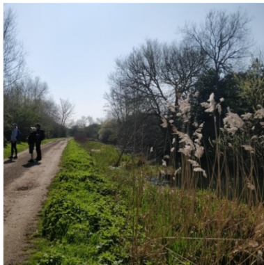
More birds or was it butterflies