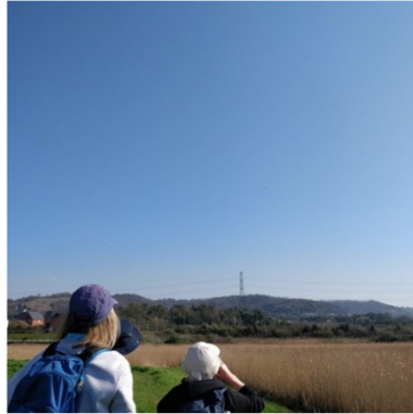
Watching the Buzzards