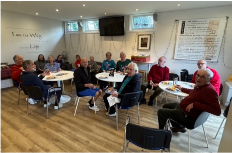
Table Tennis Group

The Table Tennis group continues to thrive, with 20 members who meet weekly at Allington Baptist Church for energetic (and not so energetic) games. We have a good mix of abilities and have all improved since playing with the group. We also have a lot of laughs both during games and over